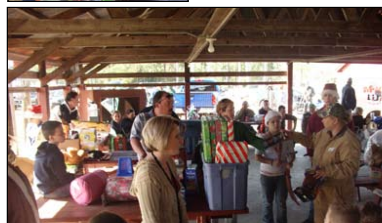
"Look at all the toys." Best Bikers Ever!