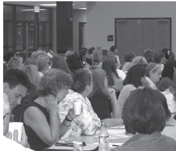
Teachers and instructional paraprofessionals participated in quality training sessions.